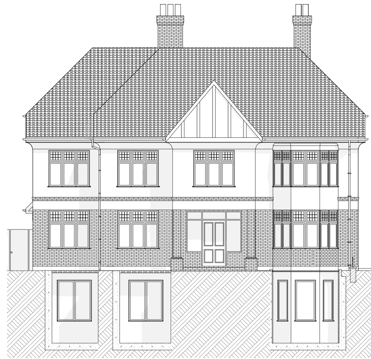
05 FRONT ELEVATION 1:100