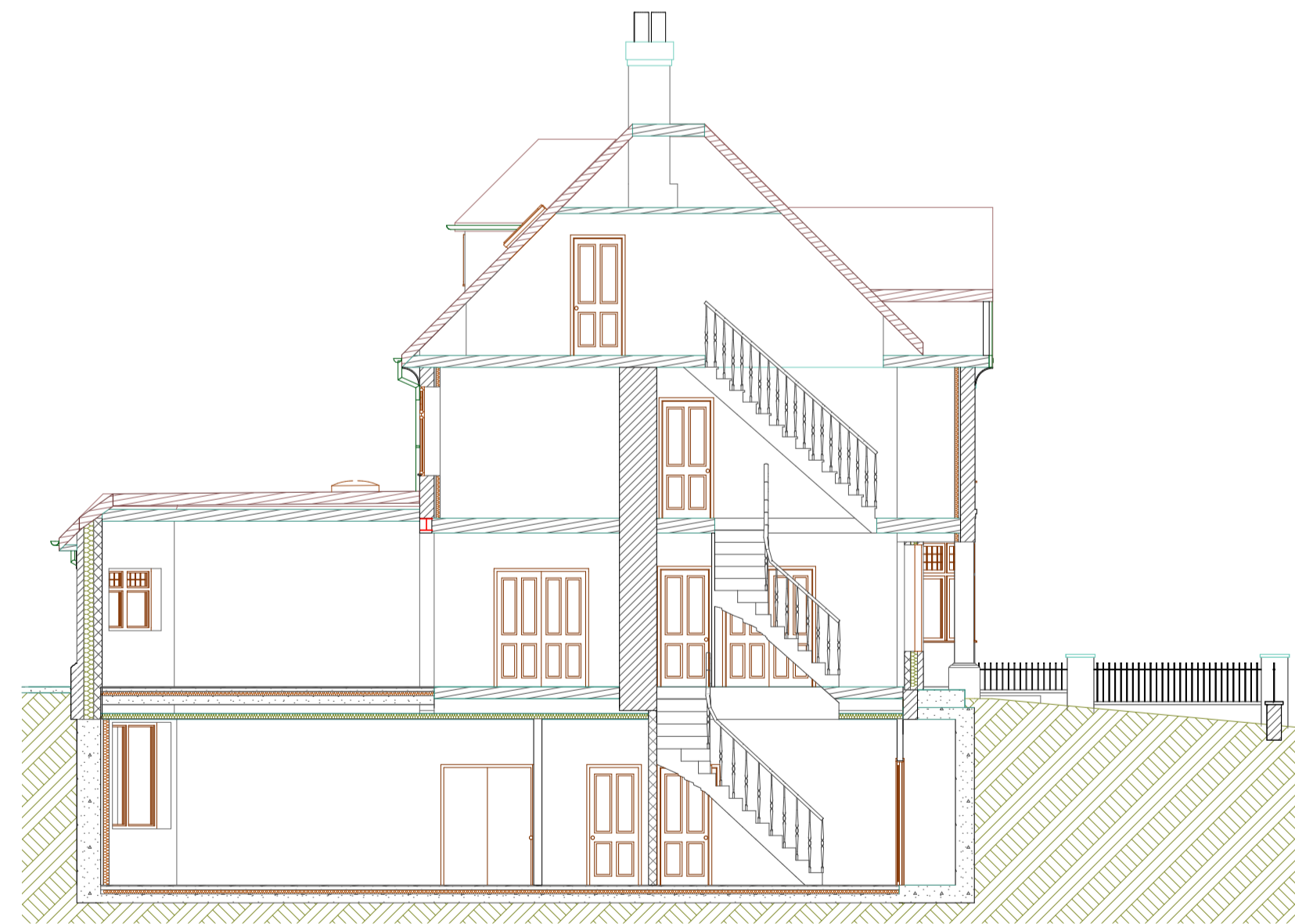
03 SECTION 02 (1) 1:100