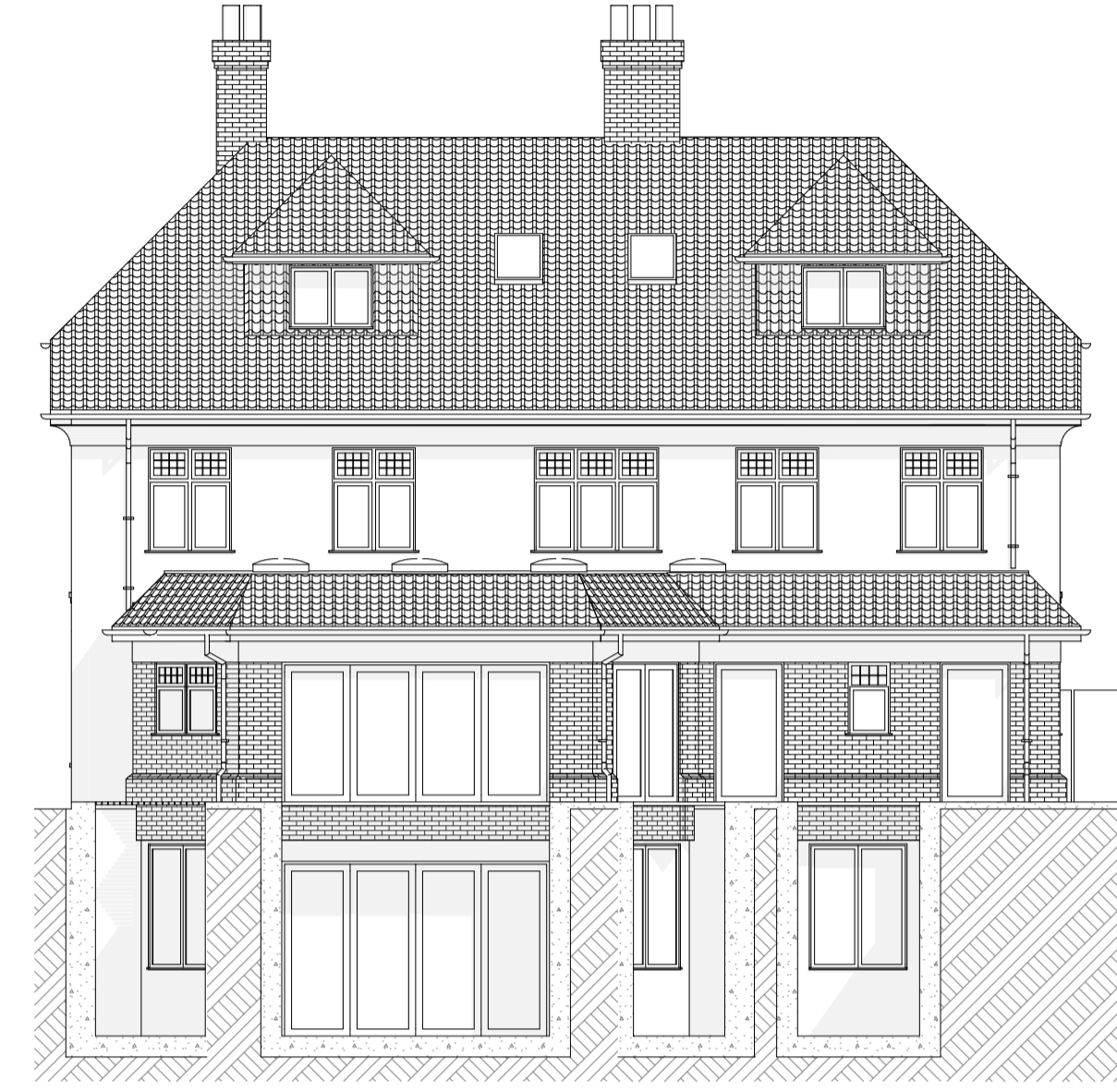
06 REAR ELEVATION 1:100