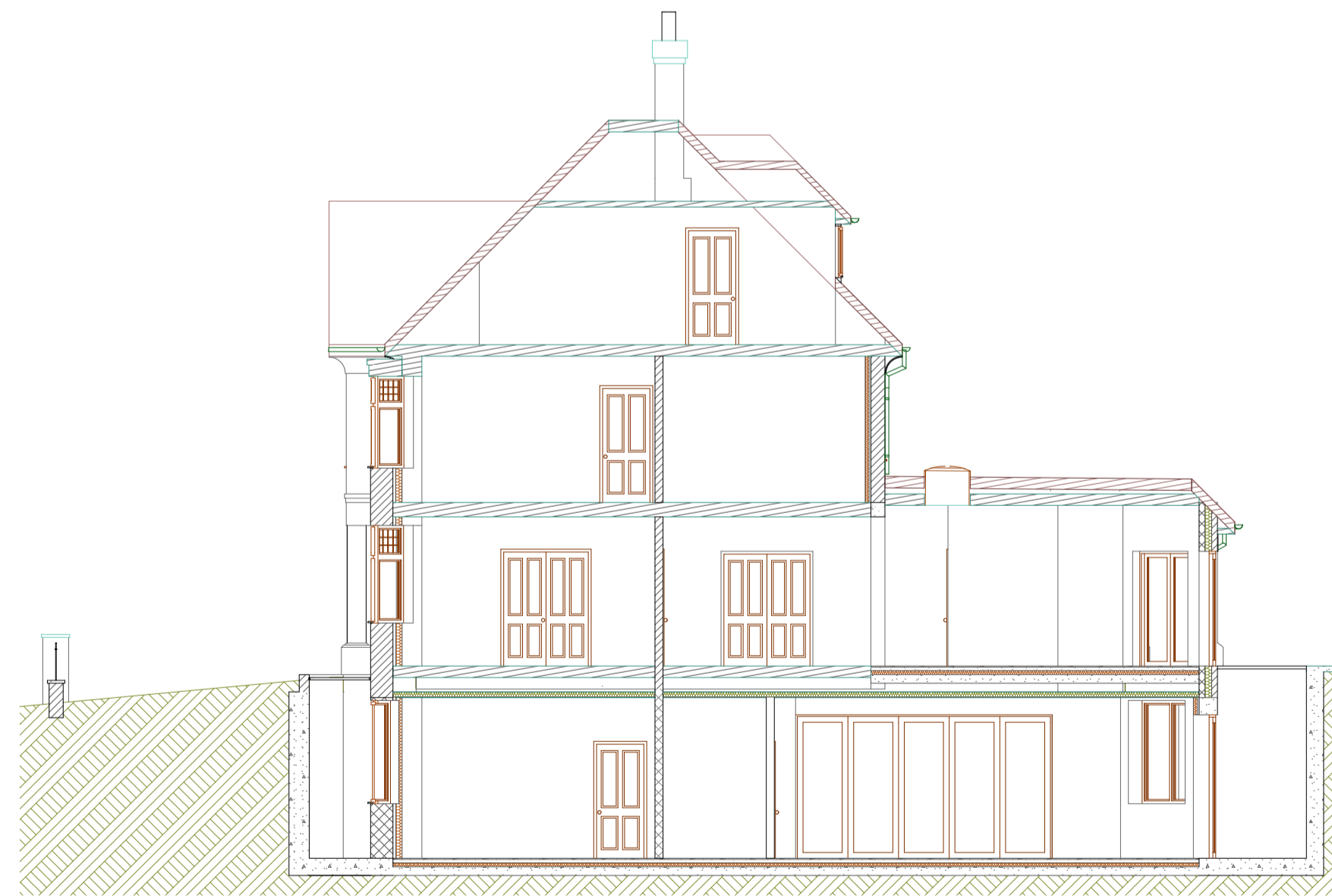
02 SECTION 01 1:100