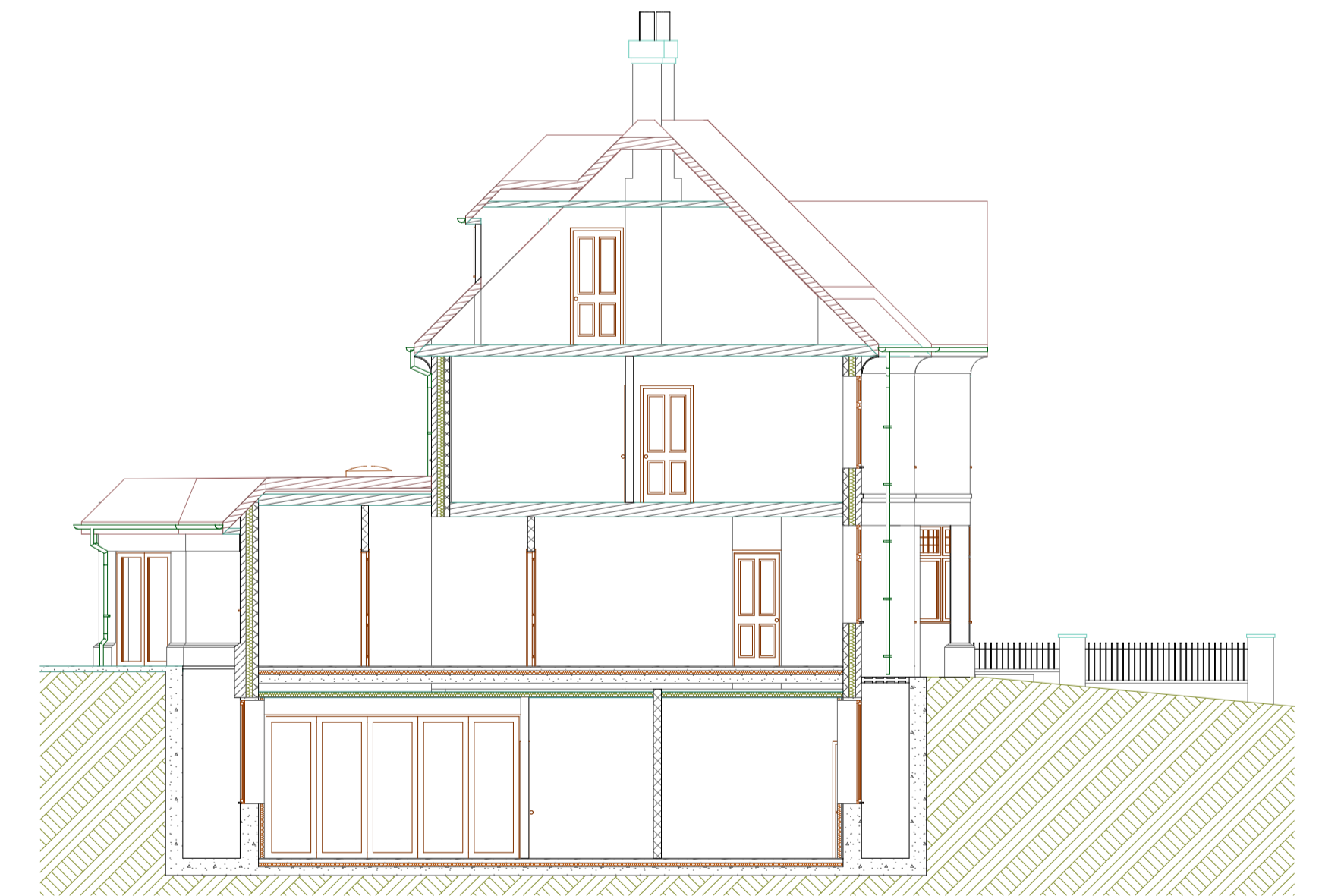
04 SECTION 03 1:100